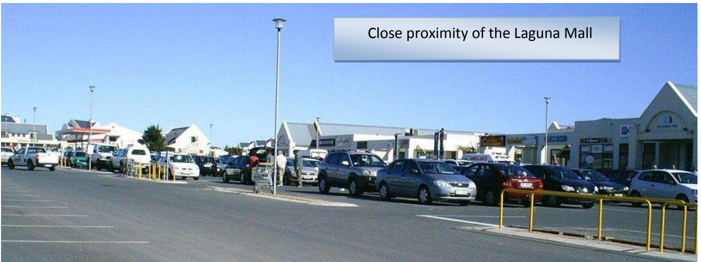
Close proximity of the Laguna Mall